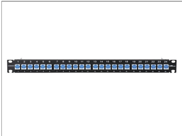
FutureCom™ Patch Panel 19 for 24 Keystone modules, integral strain relief, 1U, 24 ports, black