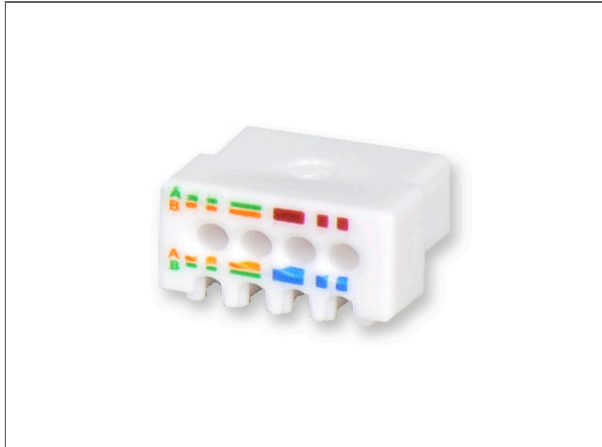
FutureCom™ xs500 Copper jack, Cat.6A, Keystone, AWG 22-24, single pack