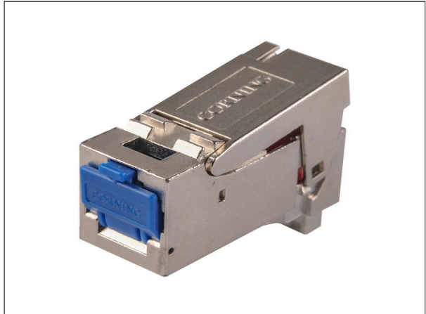
FutureCom™ xs500 Copper jack, Cat.6A, Keystone, AWG 22-24, single pack