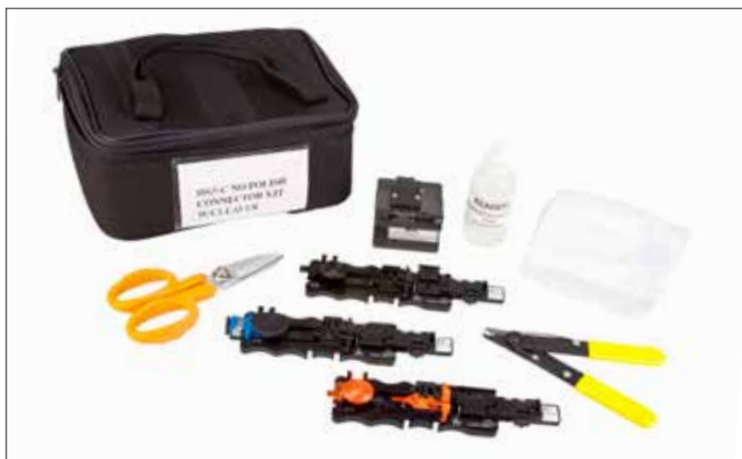
No Polish Connector Kit with CI-01 Cleaver (8865-C)