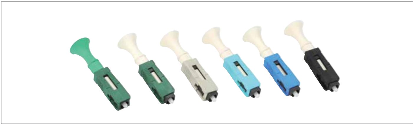
Corning No Polish SC Connector Family