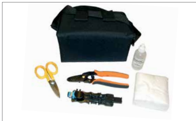
No Polish Connector Kit without cleaver (8865)