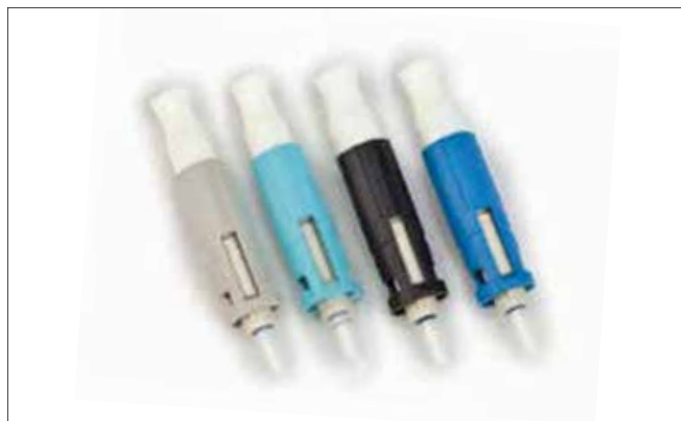
No Polish ST Connector Family