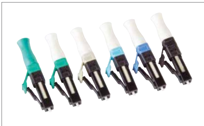
No Polish LC Connector Family