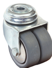
Non-locking medium duty castors Castor height 70mm.

Please note that all cabinets are normally supplied with light duty castors (not shown here).