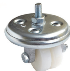
Non-locking heavy duty castors Castor height 70mm.

*On 1200mm deep cabinets you will require 6 castors