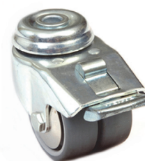
Locking medium duty castors Castor height 70mm.